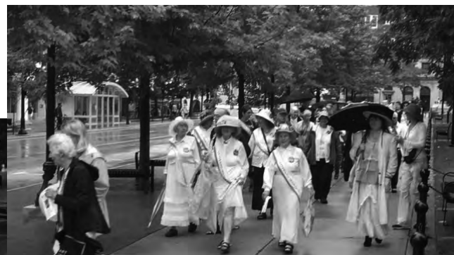
Members participating in the Ratification Celebration in June.