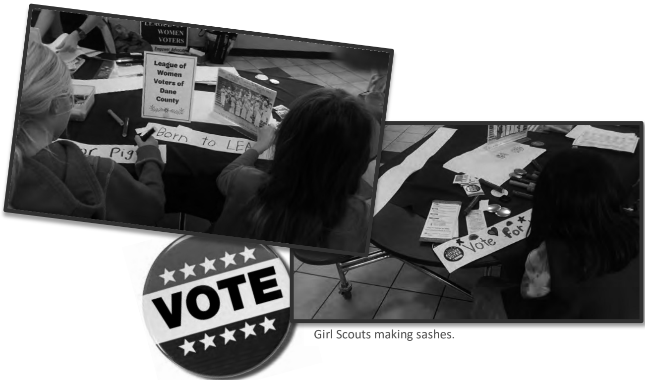
Girl Scouts making sashes.