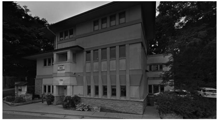
The front entrance to 720 Hill St. faces the driveway from Hill Street (left) to the parking lot behind Whole Foods (right), where we have three-hour parking. Our suite, suite 200, is one flight up through this front door.