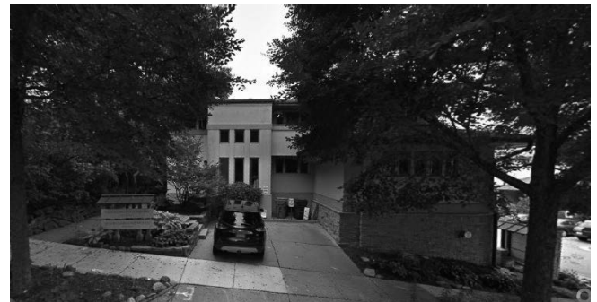
This view of the building is from Hill Street. The driveway to the Whole Foods parking lot is to the right. The two parking spaces straight ahead are reserved for our suite. The walkway to the side of the building provides a barrier-free path directly to our suite for those transporting wheeled carts of materials or who otherwise find the stairs a barrier.