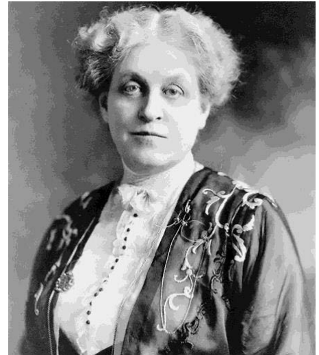
Carrie Chapman Catt