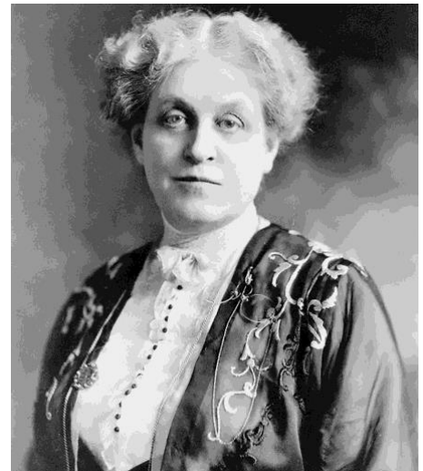
Carrie Chapman Catt