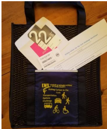
Swag bag, including bus passes, given by the League to all Challenge participants. Anyone can request one for free!

Cold-starts and idling in traffic wastes lots of gas and pumps lots of carbon dioxide into the air — really bad for the climate. Lucky us, though, Dane County and the City of Madison offer alternatives, thanks to savvy public employees who design and operate that infrastructure. So, this winter, over 47 of us will be testing out our transportation options, fighting our first instinct to jump in the car. Putting what we learned from the recent "Kicking Carbon to the Curb" forum to use, we will (when appropriate) be riding the bus, taking our bikes, walking, combining car trips, testing out what works and what doesn't, and sharing our stories.