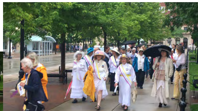
Members participating in the Ratification Celebration in June.