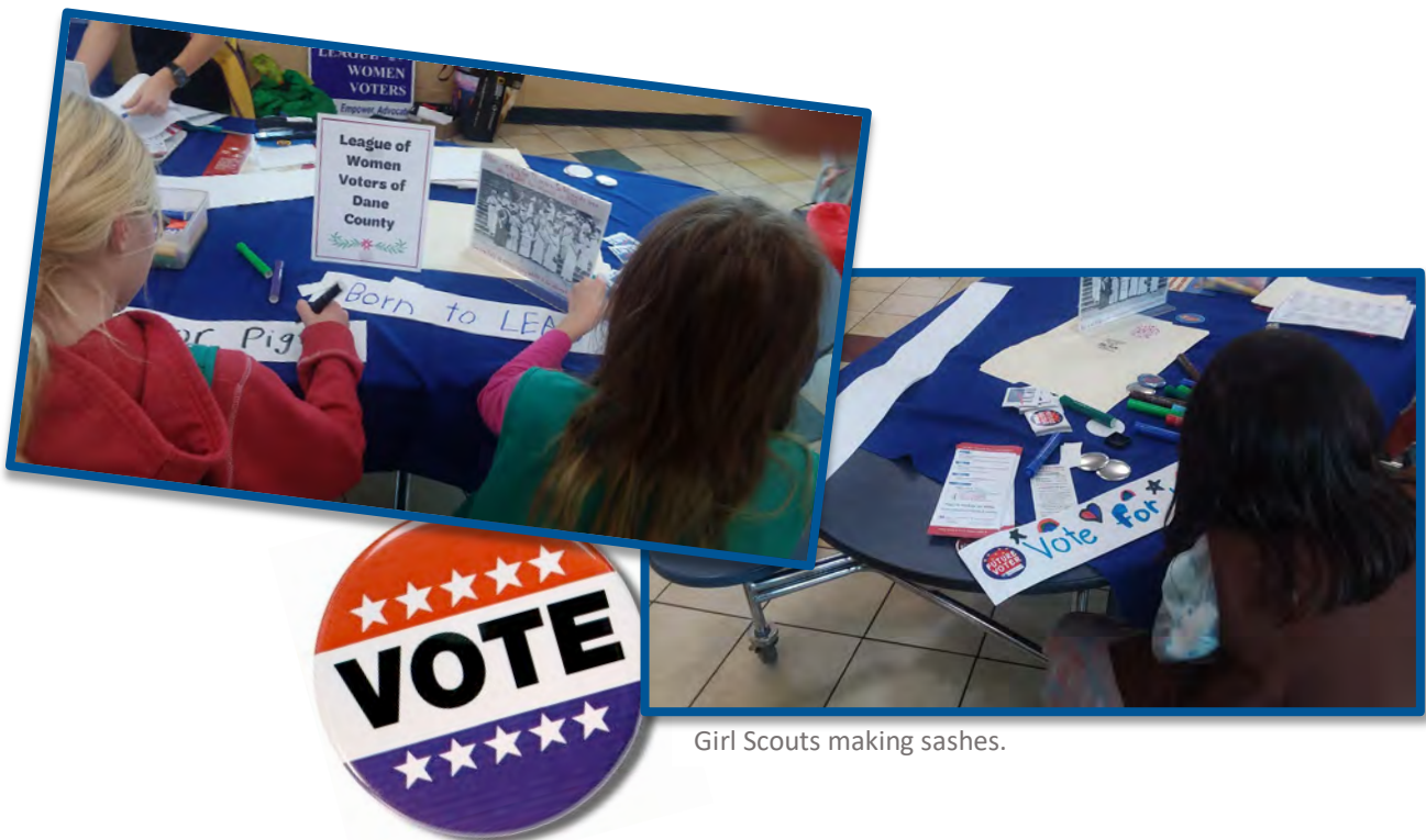
Girl Scouts making sashes.